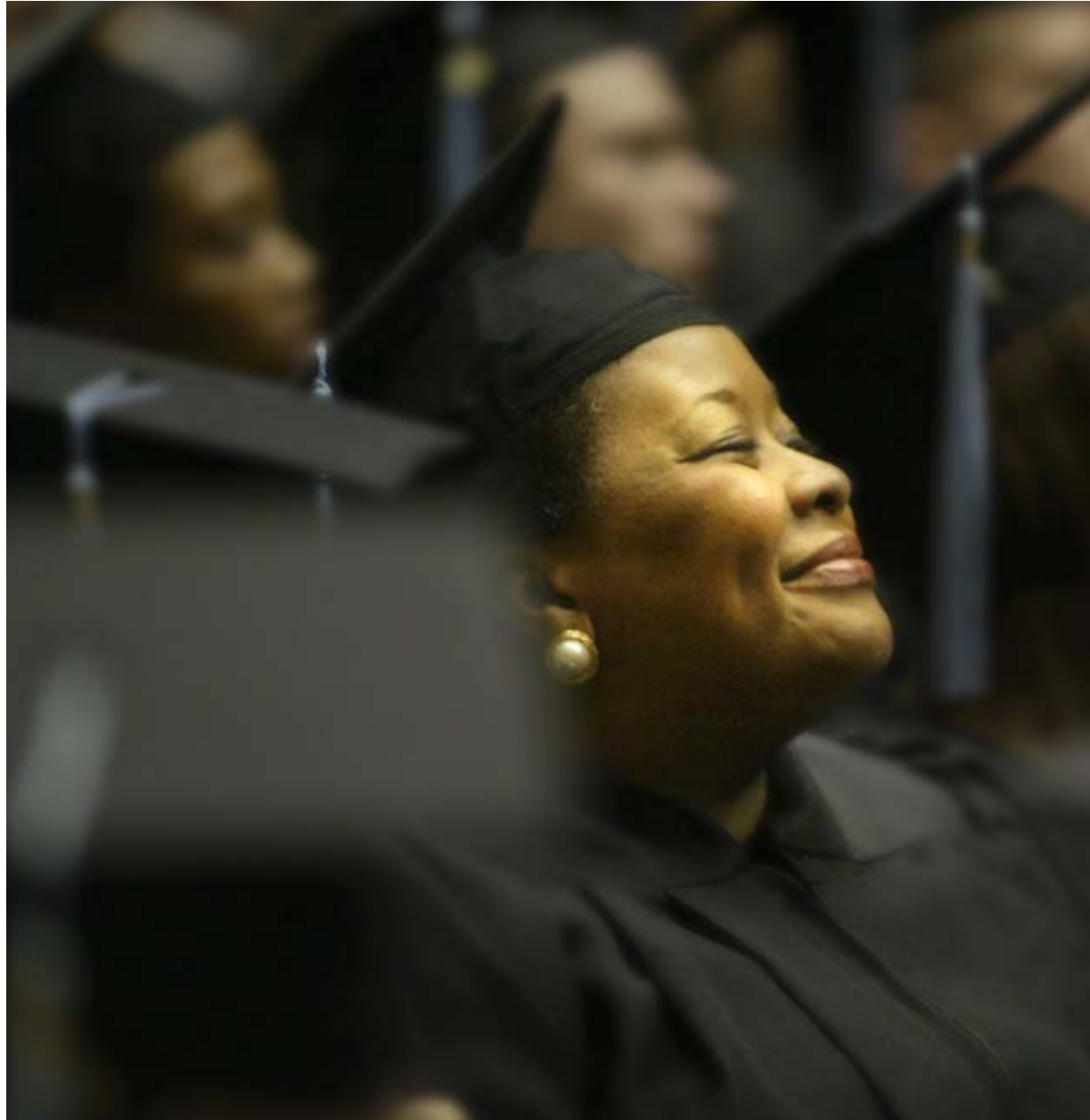
University of Wisconsin- Milwaukee

The faculty who participated in the launching of the experimental colleges in the 1960s were part of a much larger cohort—a group of early-career faculty who shared a vision for higher education. They saw themselves not as independent scholars bent on hustling a burgeoning academic market—and there were jobs and opportunities aplenty—but as contributors