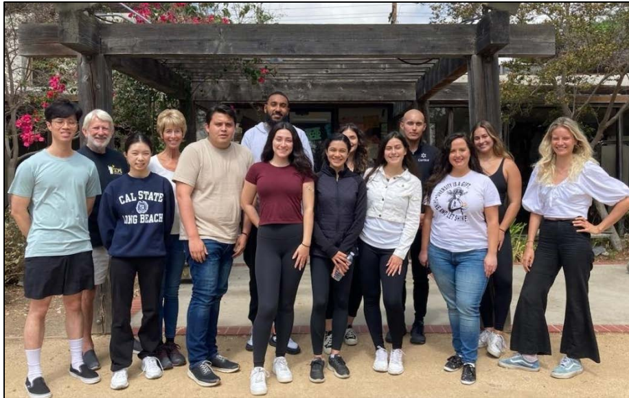
Student Leadership Institute Class of 2023 at their leadership retreat ~ September 2022