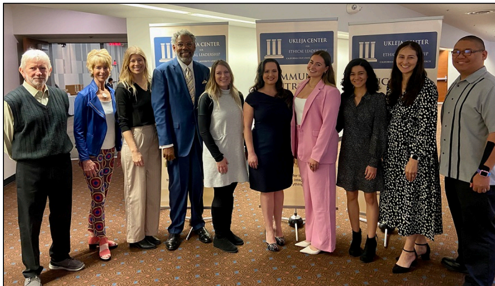
Ethics at The Beach guest speakers and event planning committee ~ March 2023