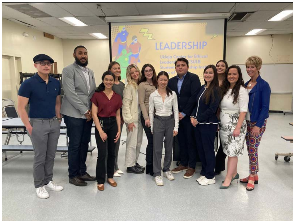
Student Leadership Institute providing an anti-bullying program at Bobbie Smith Elementary School ~ April 2023