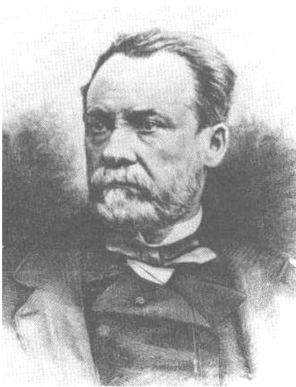
Louis Pasteur (1822–1895) Archetype Scientist