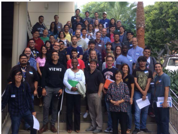
Fall 2017 Open House Attendees